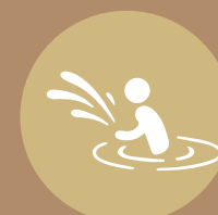
Water Play Area