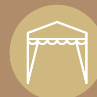
Canopy & Gazebo