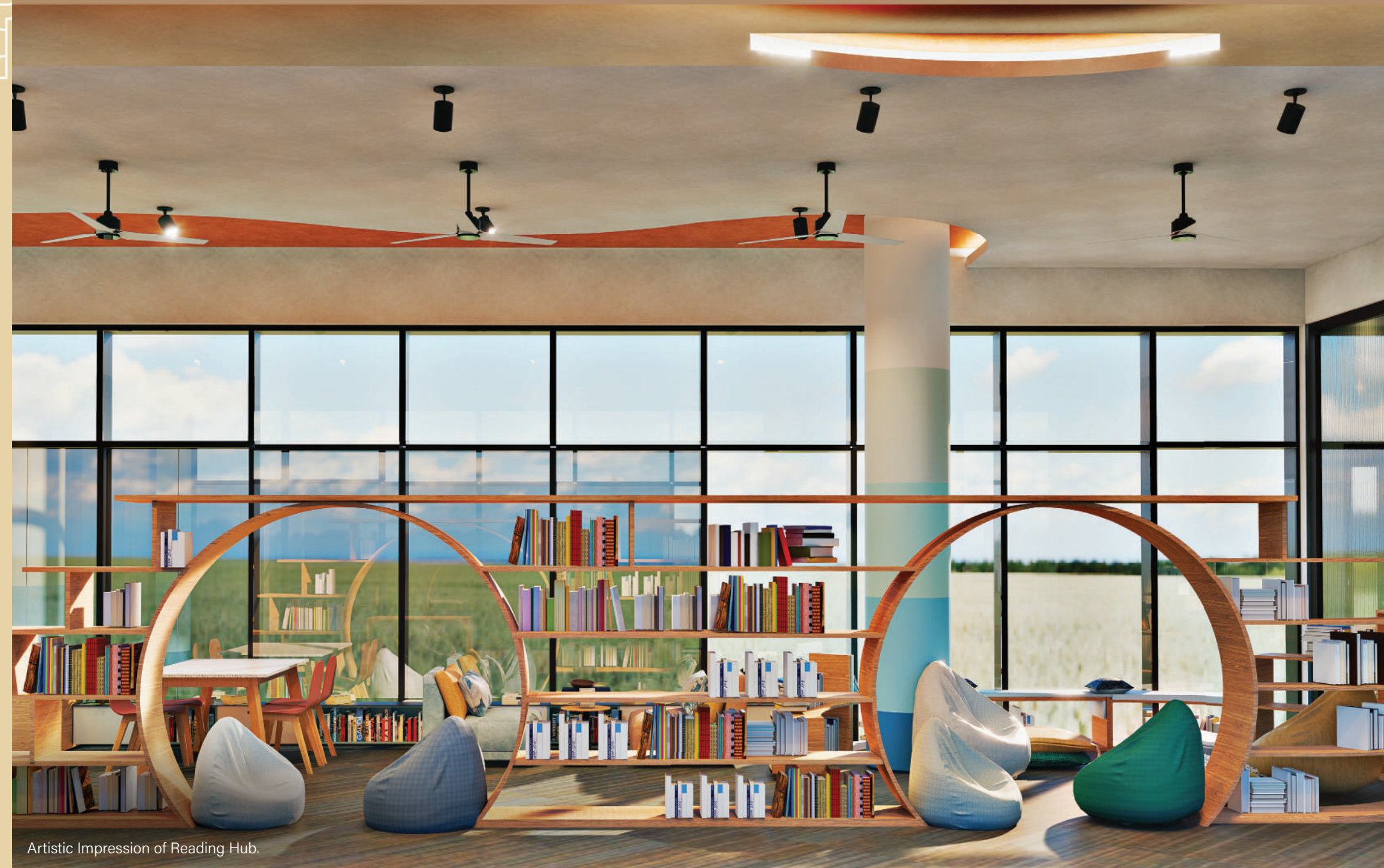
Artistic Impression of Reading Hub.