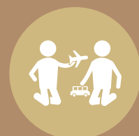
Kids Play Room