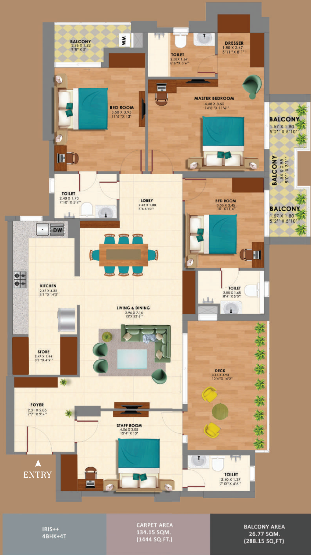
PHASE V Layout plan of 2nd, 4th, 6th, 8th, 11th, 13th, 15th, 17th, 19th Floor .