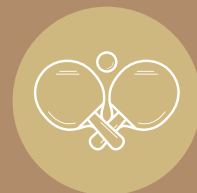
Sports Hall Billiards & TT