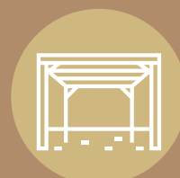
Seating with Pergola