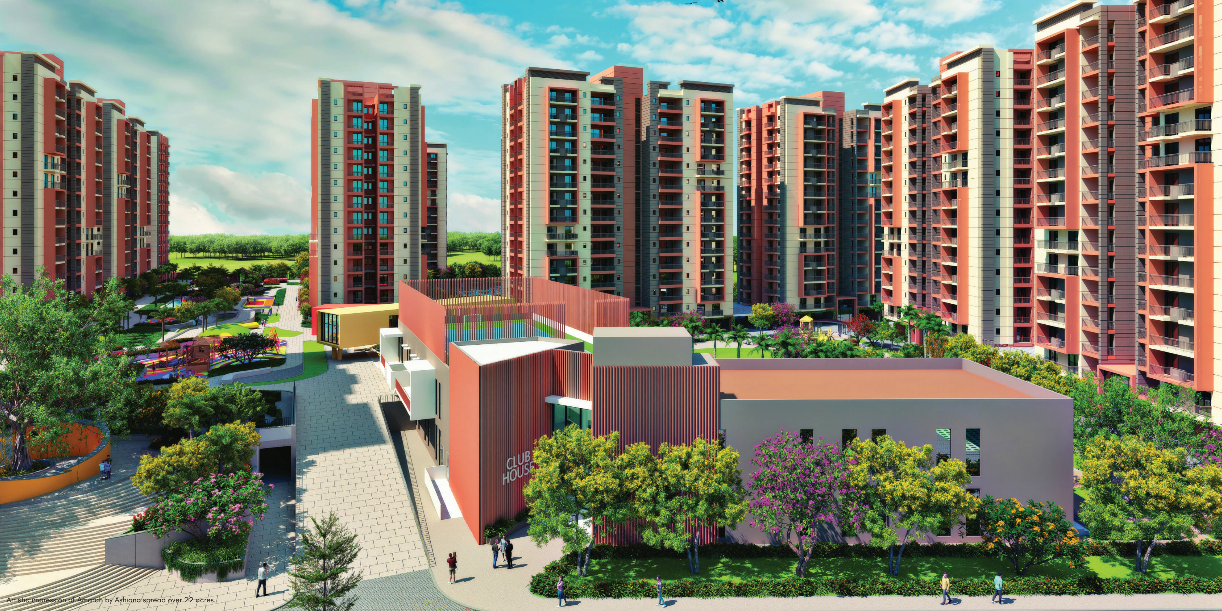
Artistic impression of Amarah by Ashiana spread over 22 acres.