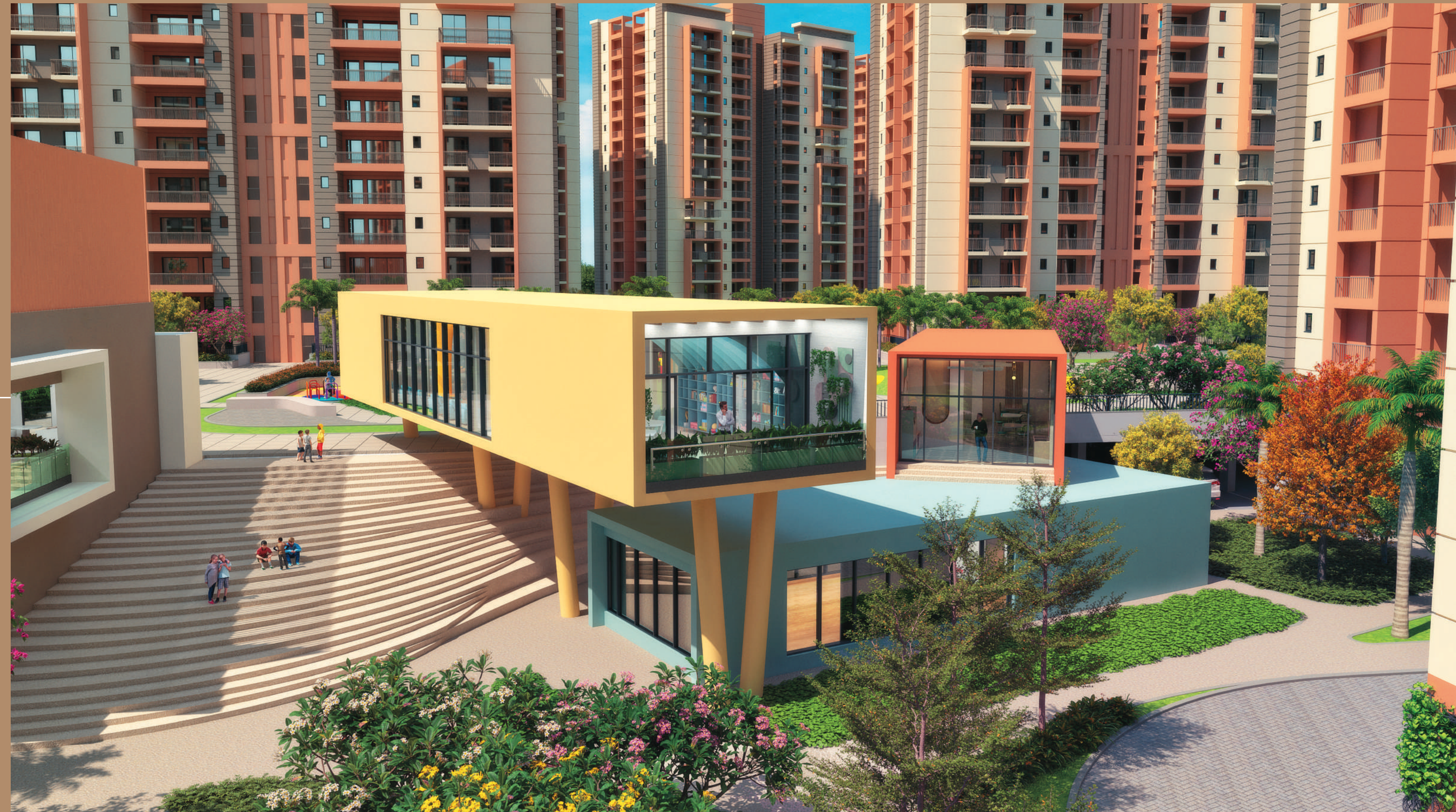
Artistic Impression of Learning Hub.