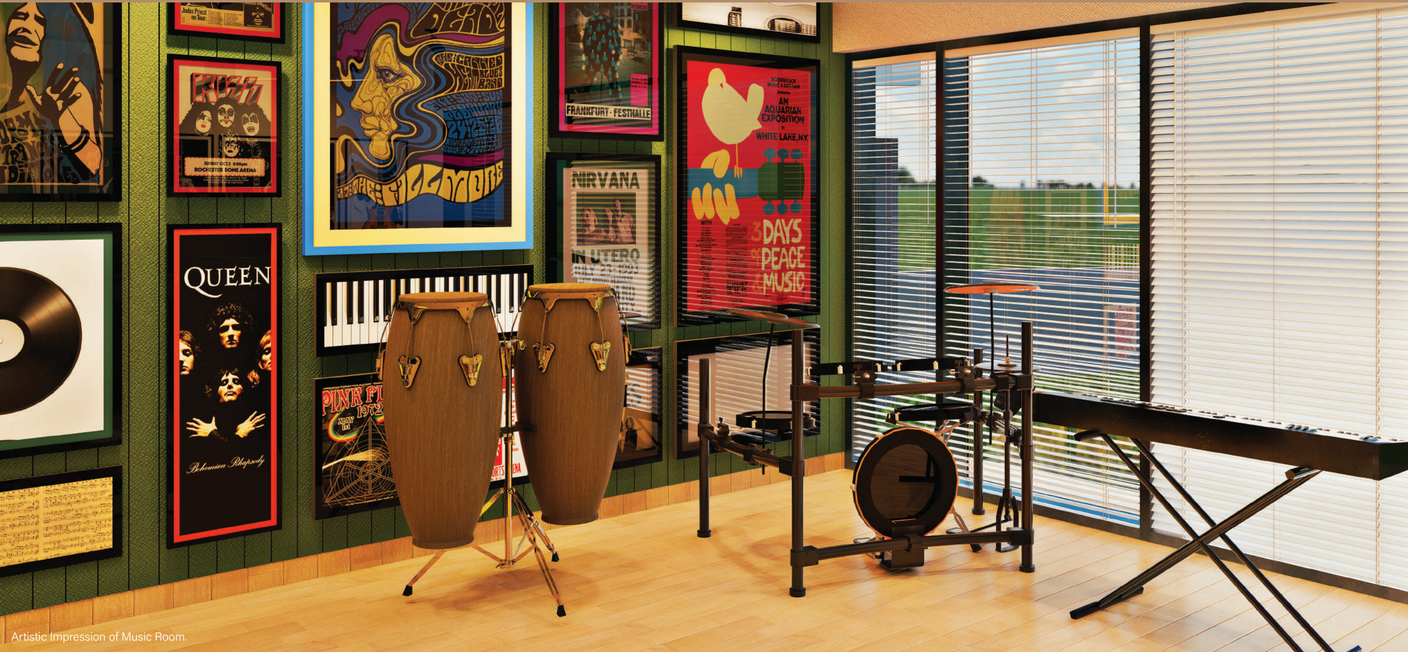
Artistic Impression of Music Room.