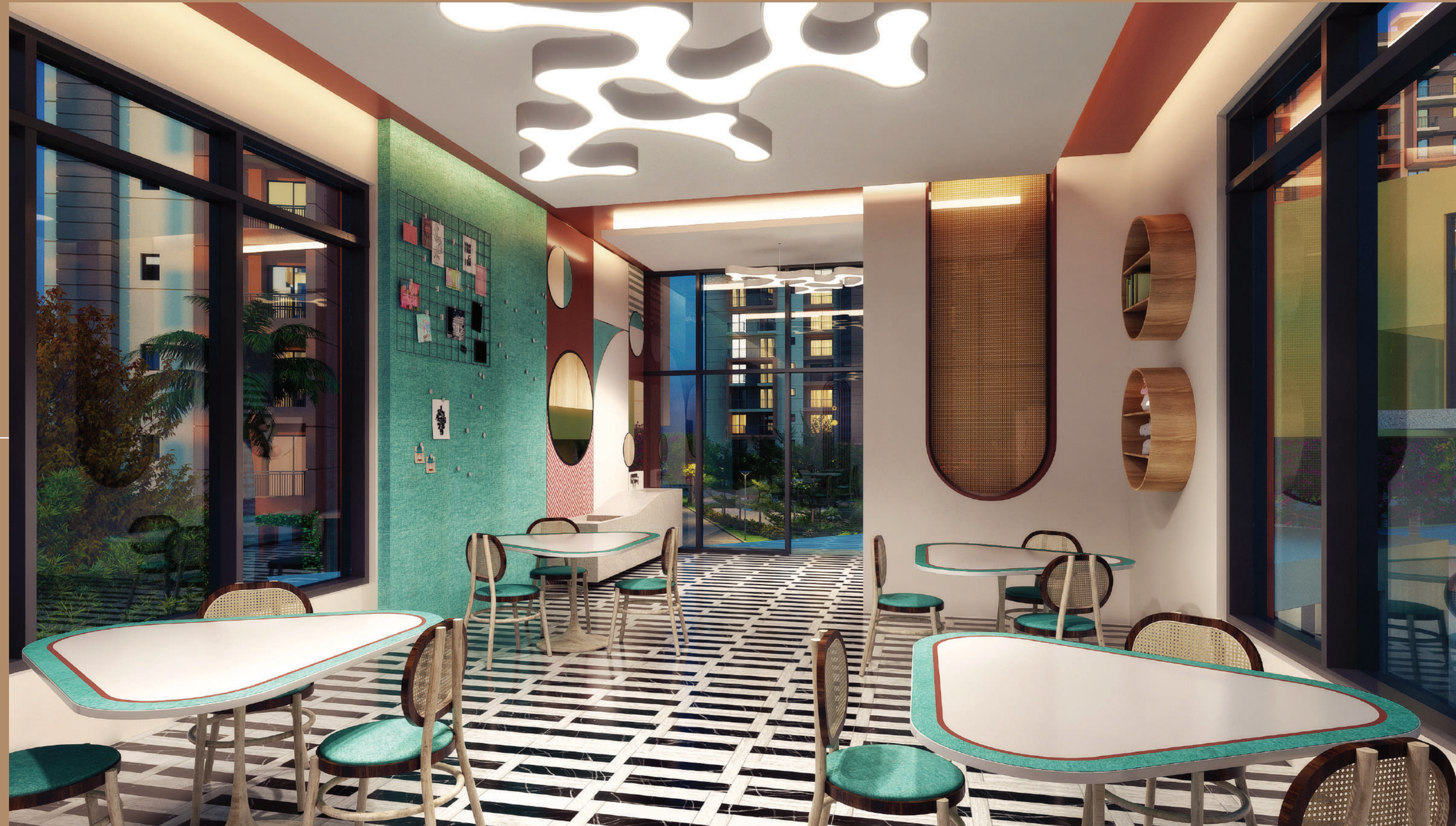
Artistic Impression of Art, Craft & Workshop Room.