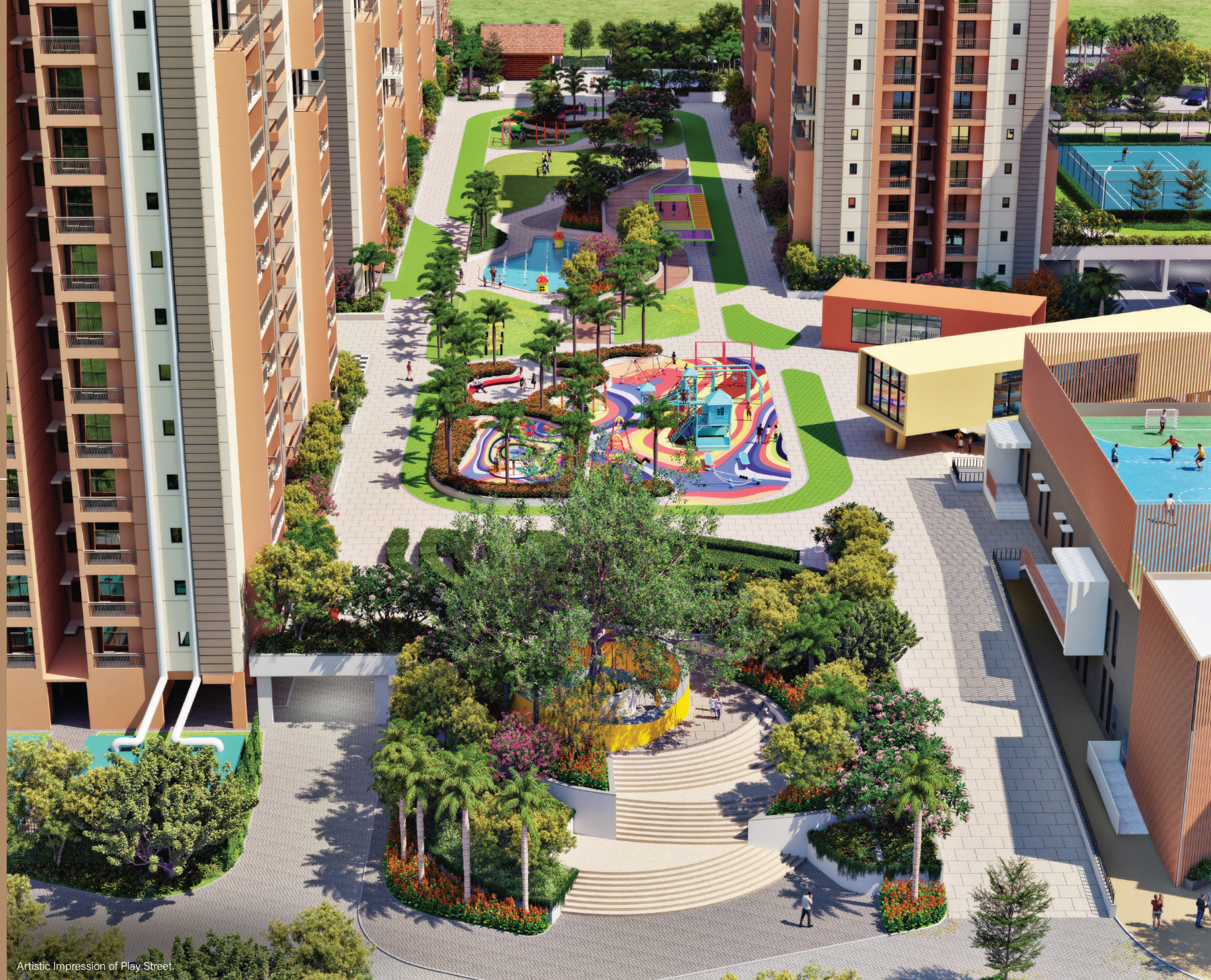
Artistic Impression of Play Street.